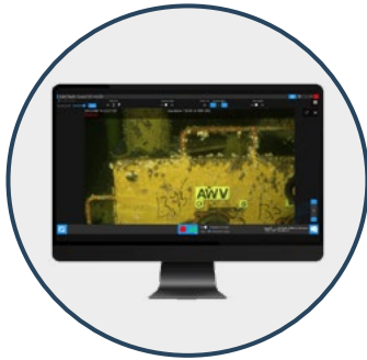
DVR+O SCI Inspection Software

Maximize the potential of your Rugged DVR+ Overlay SCI by pairing it with a SubC Imaging Rayfin camera. Access integrated camera, LED, and laser control and 12.3M still images and HD/4k video. Plus, unlock Rayfin Rapid Digital Imaging (RDI) with an adjustable capture rate up to 2Hz. With Rayfin RDI you can capture a series of high-resolution digital stills that can be zoomed in on to inspect the smallest detail or combined for a complete picture of the object being inspected.