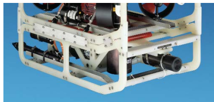
CUSTOM SURVEY SKIDS