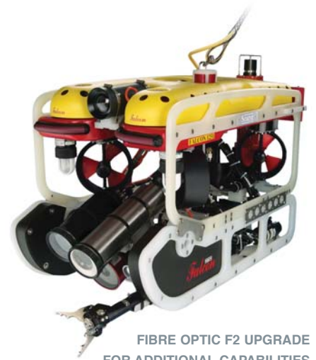
FIBRE OPTIC F2 UPGRADE FOR ADDITIONAL CAPABILITIES