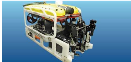
CUSTOM TOOLING SKIDS