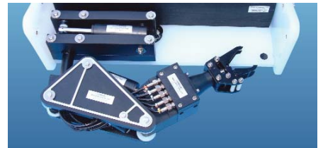
5 FUNCTION MANIPULATOR SKID