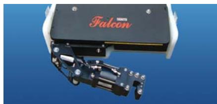
WIRE ROPE CUTTER