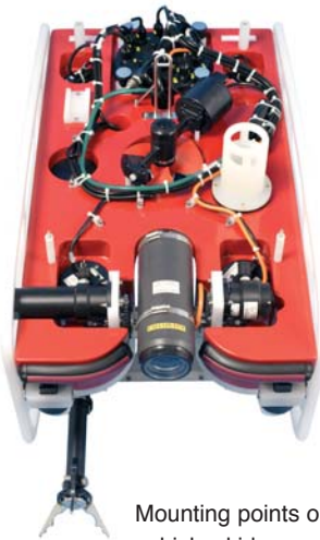
Mounting points on the vehicle skids are provided for lead ballast to trim the vehicle's centre of gravity and buoyancy.

Buoyancy and payload is provided by securing buoyancy blocks of the appropriate depth rating to the chassis below an easily removable hydrodynamic cover. The cover also provides protection to electronics housings and cabling routed along the top of the buoyancy to the junction box. This also provides exceptional ease of access for maintenance.