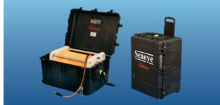
FLIGHT CASE WINCH