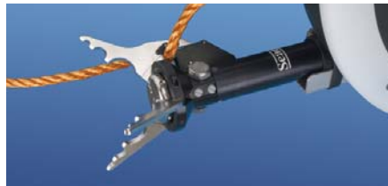
3 JAW MANIPULATOR