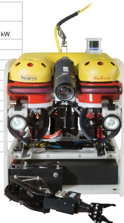
FALCON DR WITH 5 FUNCTION MANIPULATOR SKID